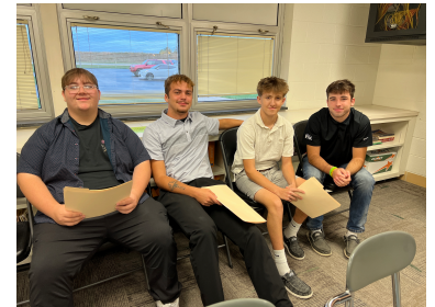
Senior Symposium 2023