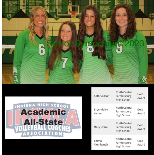
Congratulations to our Volleyball Seniors named to the Academic All-State Team!