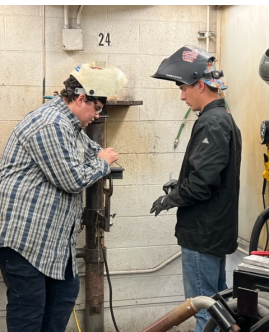
Field Trip to Local 157